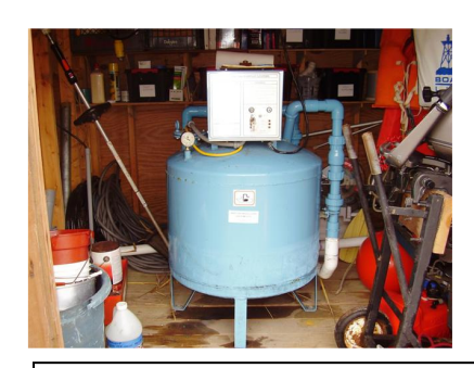
Controls and Vacuum System