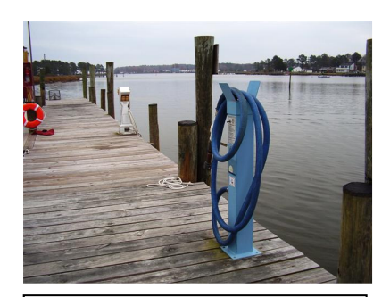
Dockside Pumpout Terminal

1. <u>Pump out Station</u>: The Seaford Yacht Club installed a certified pumpout facility eleven years ago in October 2000. The Club provides this pumpout service to any vessel, not just Club members. This is a state-of-the-art system, convenient to use, incorporating fail-safe operating features. Waste material is held in two separate 1000 gallon concrete holding tanks, which are commercially emptied when full. The facility is shut down and winterized during the cold winter months.